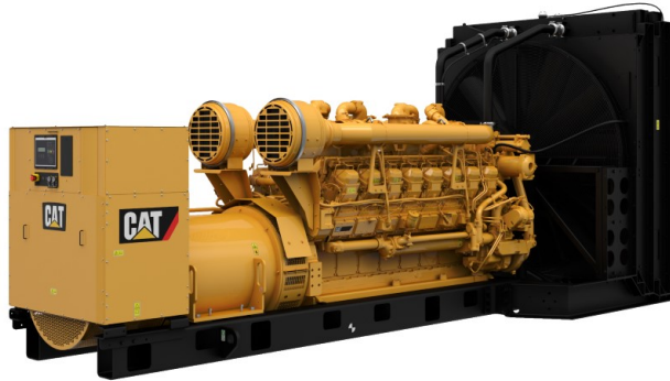
Image shown may not reflect actual configuration