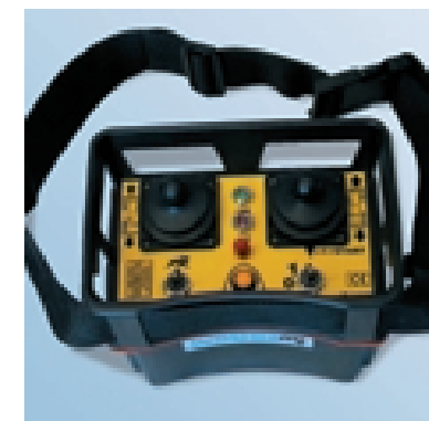
Easy-to-use radio remote control with large switches arranged conveniently.