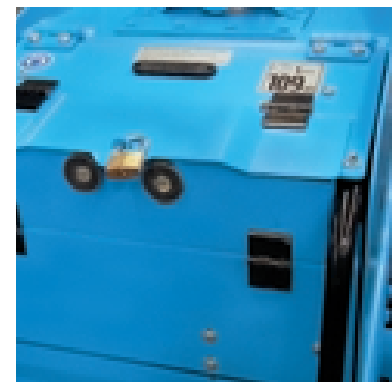
Protection cover Preventing unwanted access to controlling elements.