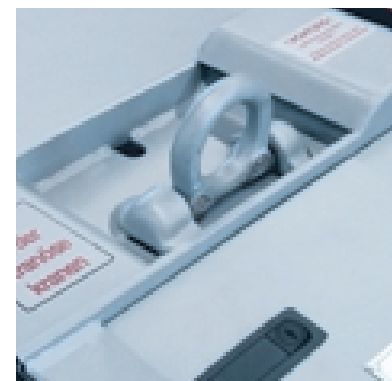
Centrally located, hinged lifting eye for easy transport.