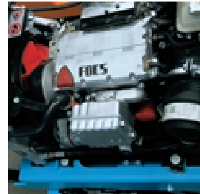
Performance and operational comfort Water-cooled 3-cylinder engines with electric starter.